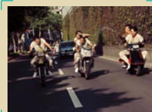
1 片名：艋舺 Monga 導演：鈕承澤 Doze Chen-Zer NIU 景點：水源快速道路 Shui Yuan Expressway