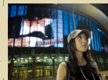
6 片名：一席之地 A Place of One's Own 導演：樓一安 Lou Yi-an 景點：臺北小巨蛋 Taipei Arena