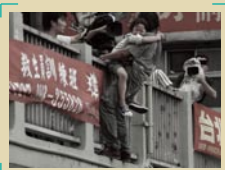
3 片名：不能沒有你 NO PUEDO VIVIR SIN TI 導演：戴立忍 Leon DAI 景點：忠孝西路、中山南路口 ZhongXiao W. Rd. ZhongShan S. Rd.