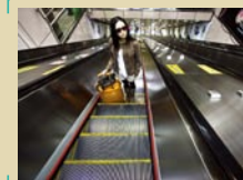
8 片名：台北飄雪（台日） Snow Fall in Taipei 導演：霍建起 Hou Jian-Qi 景點：忠孝復興捷運站 MRT ZhongXiaoFuXing Station