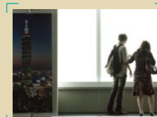
7-1 中文片名：霓虹心（台瑞） Miss Kicki 導演：劉漢威 Hakon LIU 景點：臺北101觀景台 Taipei 101 Observatory