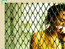
5 片名：陽陽 YANG YANG 導演：鄭有傑 CHENG Yu-Chieh 景點：體育操場 College playground