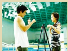
2 片名：聽說 Hear Me 導演：鄭芬芬 Zheng Fenfen 景點：石牌國中游泳池 Swimming pool of ShiPai junior high school